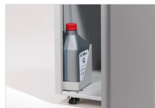
AUTOMATIC OILING SYSTEM

Two entry openings and two sets of cutting knives for the separate insertion and shredding of paper and CDs/DVDs/credit cards. Two integrated and removable bins to separate shredded paper from plastic shreds.