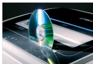
TWO SEPARATE SETS OF CUTTING KNIVES

Shows the shredding load required to optimize shredding without jams.