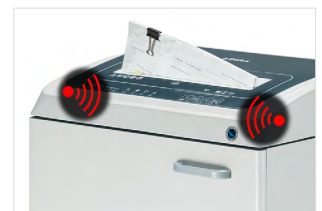
METAL DETECTION SYSTEM SHRED GUARD

The Automatic Oiler eliminates the need to manually lubricate the unit. Not only does this protect the blades with anti-corrosive agents, but ensures maximum reliability, efficiency and capacity.