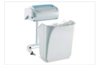
REMOVABLE WASTE BIN

Optical illuminated indicators for power saving stand-by mode.