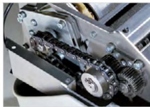
SUPER POTENTIAL POWER UNIT

Motor thermal protection. Continuous duty motor, no overheating and no duty cycles. Carbon hardened steel cutting knives unaffected by staples and clips.