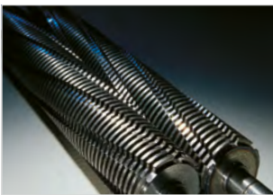
24 HOUR CONTINUOUS DUTY MOTOR

Motor thermal protection. Continuous duty motor, no overheating and no duty cycles. Carbon hardened steel cutting knives unaffected by staples and clips.