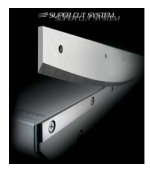
SUPER CUT SYSTEM Carbon hardened steel blades and counter-blades with 65° sharpening for long-lasting cutting operations