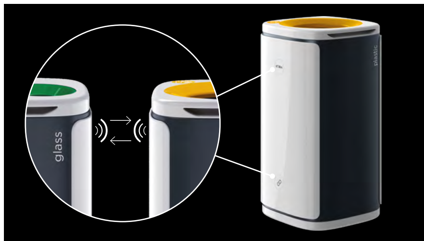
Two round areas located on each side include a magnet for easy joining of more bins to each other.