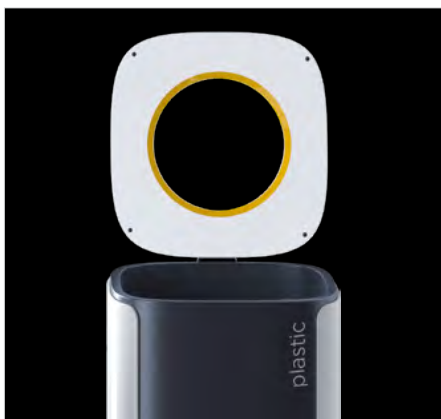
Quick and easy replacement of the bag.