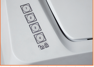
(Option) 4 Digit Electronic Combination Lock