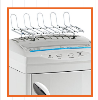
TOP SHELF (OPTION) Document top shelf to save office space (space saving design)