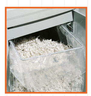
FRONT DOOR FOR EASY EMPTYING of collection bag (capacity of 1.000 sheets in straight cut)

CARBON HARDENED STEEL CUTTING KNIVES unaffected by staples and clips.