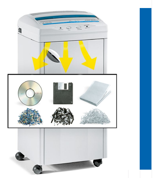
CERTIFICATION MARKS: CB - CSA - CE