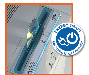
ENERGY SMART® Power management system with illuminated indicators for power saving in stand-by mode