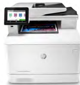
HP Color LaserJet Pro M479fnw

Dynamic security enabled printer. Only intended to be used with cartridges using an HP original chip. Cartridges using a non-HP chip may not work, and those that work today may not work in the future. Learn more at: http://www.hp.com/go/learnaboutsupplies