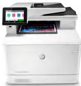
HP Color LaserJet Pro M479dw

Winning in business means working smarter. The HP Color LaserJet Pro MFP M479 is designed to let you focus your time where it's most effective—growing your business and staying ahead of the competition.